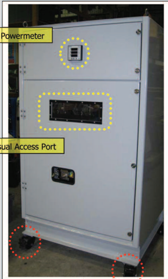
Large Lockable Transport Wheels